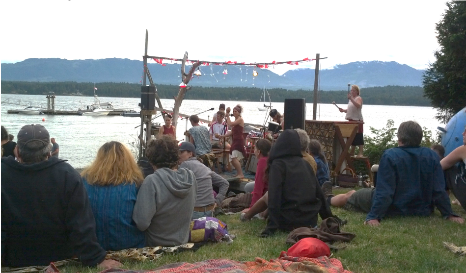
Figure 3 - Canada Day 2016. The marimba band (with author on drums) plays its annual gig outside The Thatch pub and ferry terminal where there is a boat race (boats made from recycling centre and free-store materials) and tug-of-war.