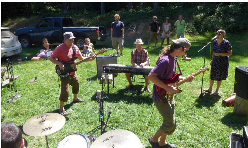
Figure 2 - Summer of 2013 - this was the first live broadcast of an entire band on Hornby Island on Radio 96.5 CHFR. Members of the Island's reggae and soul band performed an impromptu free event outside the radio station at the Joe King Ball Park as an experiment (the author is on drums).

When musicians speak of vibe and vibrations, inevitably the subject of “energy” arises as an essential component of vibe or simply a synonym for vibe. 5 Musicians intuit that the kinds of songs they play, the order in which they play them, their own demeanour, and so many other countless factors all change the energy in a space. Such a process involves a participatory exchange between performers and audiences, the positive or negative feelings evoked—the vibes—as interactions in a dialogue of give and take. Vibe and energy also imply more or less friction between transactions. This transfer is a kind of gift process (Hyde, 1999), the sum of which might leave performers and audience members saying things like, “It was electric! We were hanging on every note.” For community solidarity, the rewards of these kinds of exchanges of energy are short and long term, and of course, these are also felt within bands of community members in addition to influencing the people who may attend their performances: