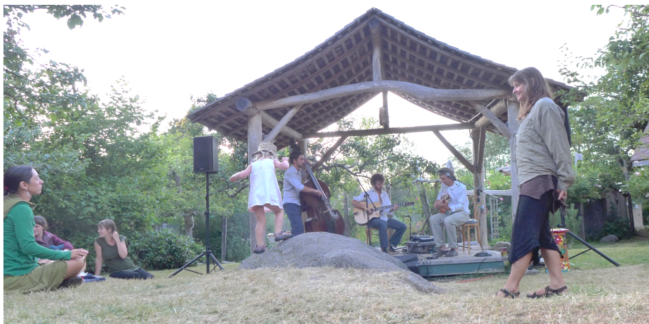
Figure 5 - Summer 2013. Every Wednesday and Sunday the Cardboard House Bakery and Pizza Galore host musicians in their orchard. A local swing trio entertains the audience and kids who line up to jump off the rock in front of the stage.

moment's (transient and temporary?) 12 lack of visible all-women music groups (Candlish 2013). This echo of the past also reflected the significance that lesbian feminism had on Hornby in the 1970s and 1980s, including "lesbian 'separatists' who moved to rural settings to live collectively away from urban heteropatriarchy [who] had a clear idea about the importance of nature in their culture, and the importance of their culture to ecology" (Sandilands, 2002: 132).