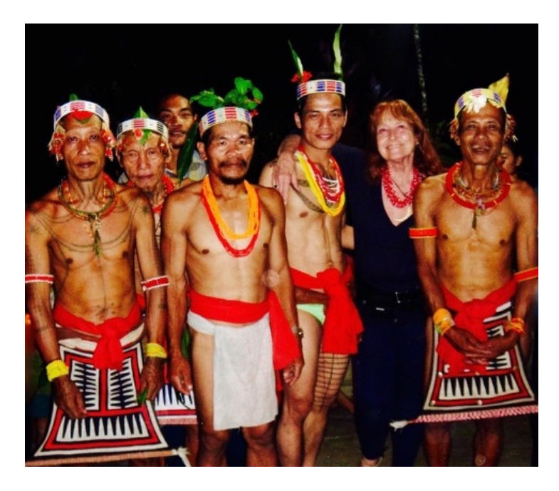
Figure 3 -The author with Several Siberut (Si)Kerei (including a young field assistant studying traditional beliefs)

Sa is a plural unity of something. The root of bulungan is bulu, meaning 'to offer'. Bulungan is understood as a group of unknown spirits. Sabulungan is thus a group of spirits, to which a special offering (buluat) is given. So, arat Sabulungan is the belief focused on the existence of spirits... Sabulungan is used to refer to all the spirits in the invisible world, some who are deceased human beings (ukkui),<sup>13</sup> the rest of these spirits are spirits of water, forest, and so on. (2013: 69, 70)