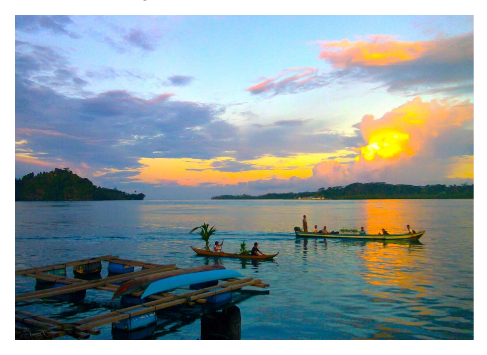
Figure 2 – Ocean travel by dugout and motorboat at Sikakap Harbor, North Pagai

only by boat.<sup>5</sup> Unlike Tahiti, Fiji or the Hawaiian chain, the growing international recognition of Mentawai is not due to popularisation of an established distinctive indigenous culture, but instead results from a confluence of unusual forces in the everpresent ocean. Because fishing is one of the few protein sources, members of numerous Mentawai clans have claimed historical land rights for foraging and hunting on the 65+ uninhabited small islands, and marine rights for fishing at traditional fishing spots the clan has used for generations, as well as fishing off specific shores and over specific coral reefs. Historically, women fish in the coastal waters and rivers for smaller fish, snails or shellfish, while Mentawaian men, who in previous generations set offshore nets held by wooden floats ( talakat battau ) —with some floats carved to resemble a (guardian) — will work to fish and also to capture sea turtles.<sup>6</sup>