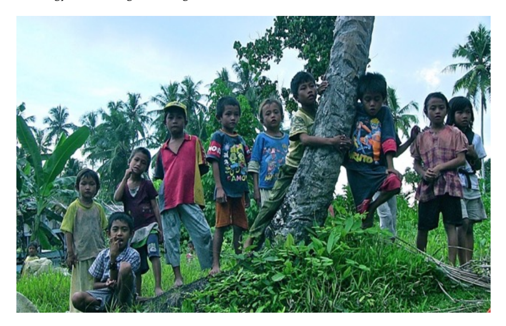
Figure 9 - Children greeting our docking party where the bilou lives, near Betumonga village, North Pagai

bilou simultaneously as a changeling human and a rainforest spiritual guardian. A bilou vocalisation at the "wrong" time is a harbinger of death, yet ( Si ) Kerei can reverently approach the Sanitu Bilou for indirect healing help. Meanwhile, stylised (thus unrealistic) bilou vocalisations are part of numerous songs, and the actual calls are imitated as entertainment by whistling and falsetto vocals by all ages with varying degrees of success. Unfortunately, deforestation and modern hunting methods have caused the bilou and other Mentawai primates to be greatly reduced in numbers. Similarly, the combined effects of colonisation and forced Christianisation has caused the songs of the urai bilou musical repertoire — which express the singular relationship between the bilou and humanity and rests on core cultural beliefs about the bilou — to become as endangered as bilou itself. The "songs" of the bilou , and the unique female duetting, now float over far fewer trees, and the bilou — a multi-dimensional focus within arat Sabulungan cosmology— is endangered along with its habitat.