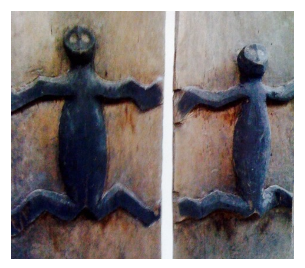
Figure 6 - Bilou carved wooden panels