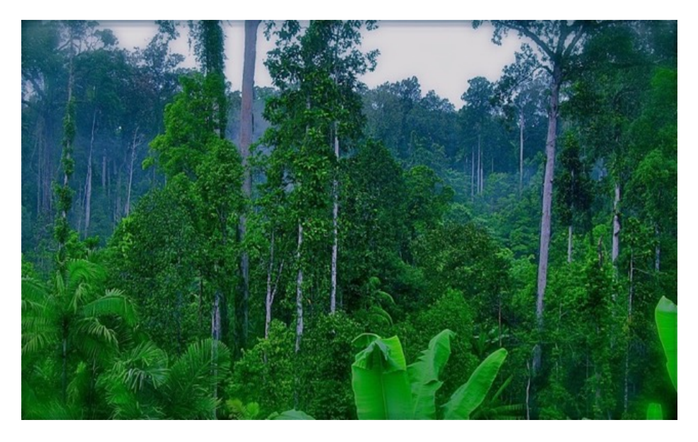
Figure 4 – Potential Primate Habitat on South Pagai (photo: L. Burman-Hall 2011)

charismatic Kloss's gibbon called bilou ( Hylobates klossii ) stands out. This endangered dwarf gibbon has traditionally inspired awe and reverence among Mentawaians, and plays a vital role in the traditional animist cosmology of Mentawai.