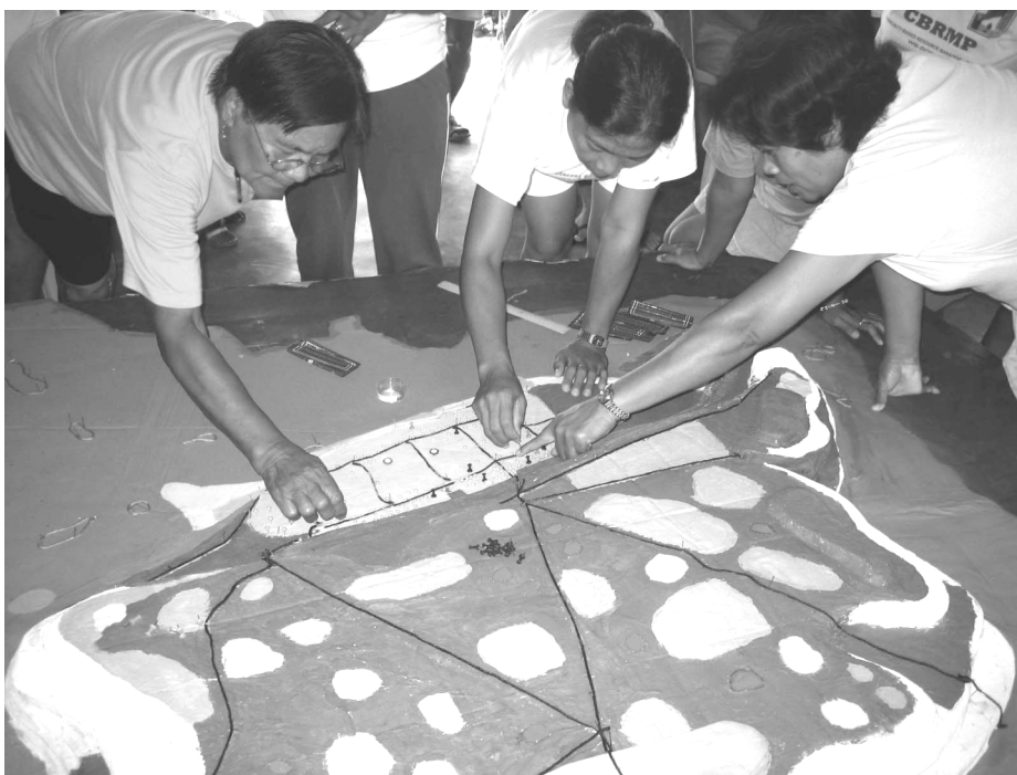
Figure 3: Plotting of vulnerable infrastructure on the P3DM

then identified the threatened assets within the community using markers, yarns and pins: houses solely made of palm, copra storage areas, fish pond, essential cultivated lands, the PO's karaoke and outrigger boat, cottages for tourists, etc. (Figure 3). The model helped participants to better identify the dangerous areas and the safe areas that might serve as a refuge in times of crisis.