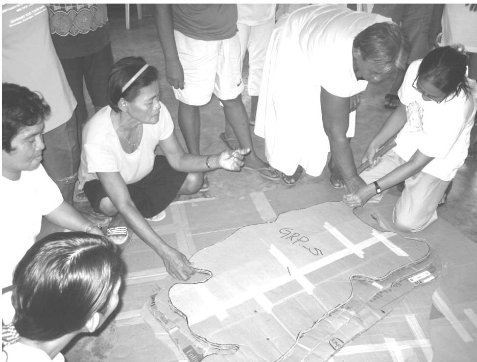
Figure 2: Assembling the P3DM of Divinubo island

After the arrival of the CBDRM-P3DM facilitators, a meeting was immediately held with the leaders of the PO to establish a schedule of activities. It was decided that building the model would take 3 days, which would also coincide with a CBDRM seminar for participants, and that the community would manufacture the 3D model inside the PO's function room. The function room would also be the centre of logistics, and most materials used in building the 3D model would be stored there. Food for the facilitators and participants would be prepared and cooked by female members of the PO. No actual building of the 3D model was made on the first day. Instead a meeting with all of the participants was held in the function room and the facilitators explained what was going to happen during the CBDRM seminar and the 3D model building. The base map to be used for the 3D model was also presented to the participants. This gave the chance for participants to ask questions and raise their concerns regarding the activities. In the afternoon, the CBDRM seminar started.