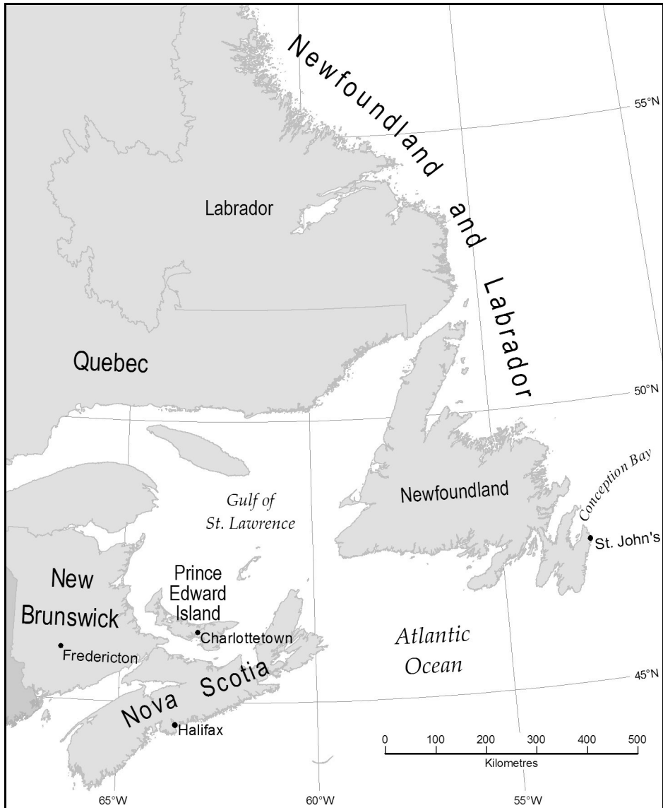
Figure 1 Newfoundland and Labrador (showing Conception Bay and St John's) (David Mercer, Map Room, Queen Elizabeth II Library, Memorial University)

Century the population quadrupled – from around 19,000 in 1803 to around 75,000 in 1836 (Mannion, 1977: 6) – and the island finally received official British colonial status in 1825. The vast majority of the settlers were immigrants from the same small areas of southwest England and southeast Ireland from which the earlier, temporary migrants had come. 5