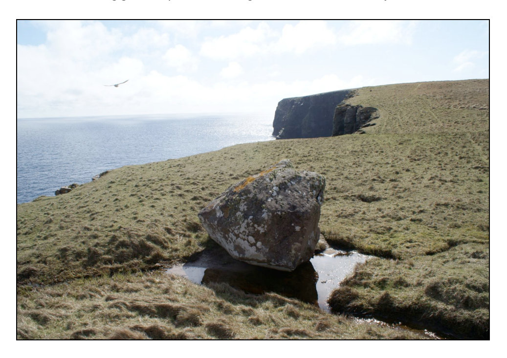
Figure 3 – The Gore's Kirning Stane

Despite the fact that the gýgr has changed sex, this story is an authentic survival of Norse tradition. It is the only example found from Shetland where the gýgr (or Guir) was remembered as a gigantic supernatural being into the late 20th Century.