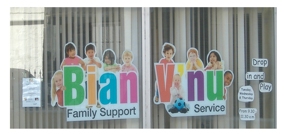
Figure 3 - Sign in Guernesiais at a family support centre

In Guernsey the appointment of a Language Officer provided a contact point for language-related enquiries. This led to increased inclusion of some Guernesiais in the branding of local products and services, and to requests from local businesses and organisations for translations of slogans: eg bus timetables, notices at an agricultural show, signs at sports centres and a family centre (see Figure 3).