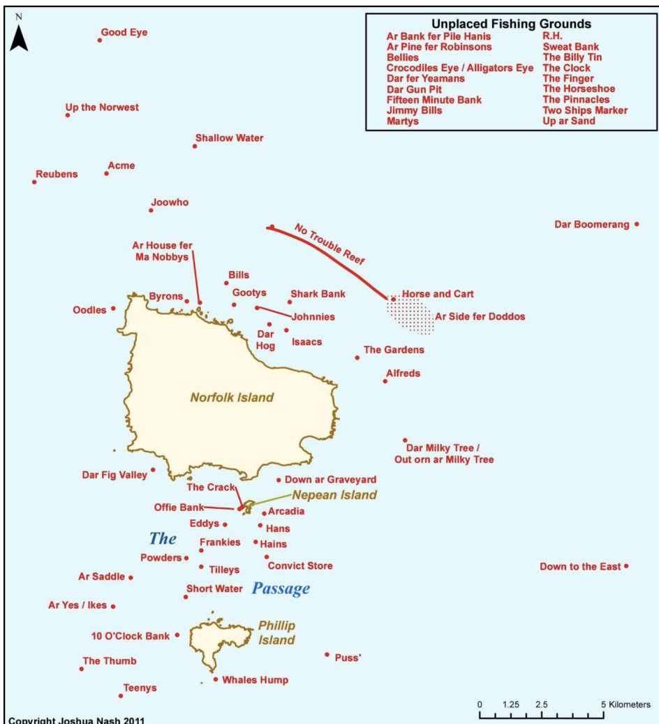
Figure 1 - Norfolk Island fishing ground names map

(linguistic and island) fieldworker engages in an artistic and aesthetic endeavour similar to Wolcott's (2005) description in The Art of Fieldwork ; ie through being admitted into private cultural realms of linguistic, social and toponymic engagement, the fieldworker as a map-maker participates in creating an artistic interpretation of placenames as artefacts within the aquapelago. Indeed, the 'no-place' nature of fishing ground names and their 're-imaginings' of space, place, and language in terms of the geographical and cultural location within island systems in the sea means they embody the idea of the aquapelago and can help to add to discussions and re-formations of what may constitute an aquapelago. The 'map as art' concept (Harmon, 2009) is also applied to toponymic maps.