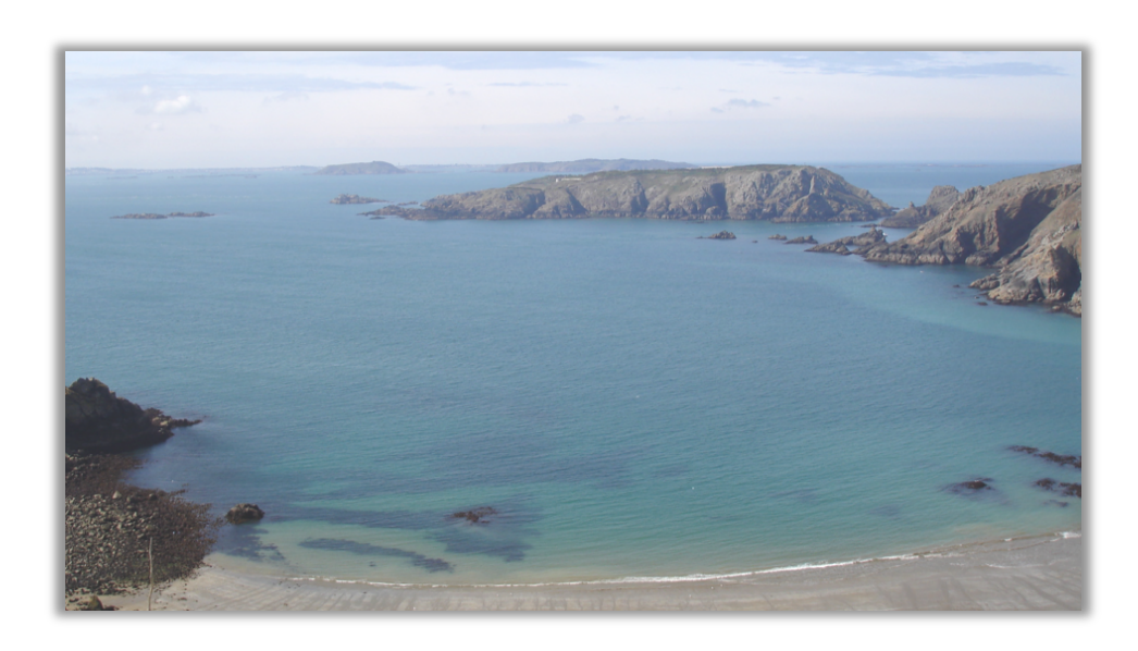
Figure 6 - View of Brecqhou from Sark. Behind Brecqhou is Herm with Jethou on its left, and Guernsey is in the background (photograph by author, April 9th 2012).