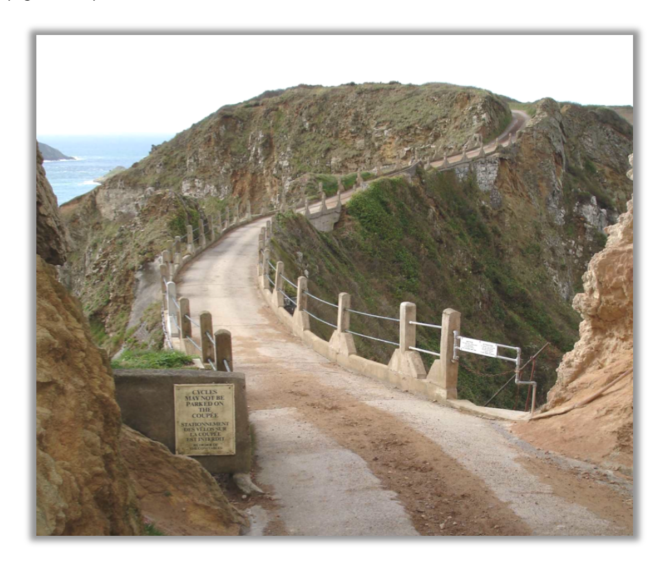
Figure 5 - La Coupée isthmus between Great Sark and Little Sark (photograph by author, April 11th 2012).

Little Corn Island in the Caribbean do, Great Sark and Little Sark are in fact parts of the same island that are joined by a very narrow isthmus known as La Coupée, which is about 79 metres high and 137 metres long (Ewen and de Carteret, 1969: 15) (Figure 5). The island's closest neighbour is the island of Brecqhou, and the distance between the islands is about 200 metres, although only about 85 metres between Brecqhou and the large Gouliot Rock (Moie du Gouliot) in the Gouliot Passage, which belongs to and is detached from Sark by just a few metres (Google Maps Distance Calculator, 2013: online) (Figures 6-7).