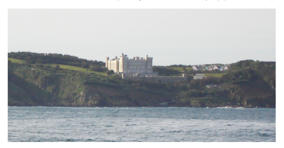
Figure 4. View of Fort Brecghou (photograph by author, April 6th 2011).

Since the 15th Century, the Channel Islands have divided into two bailiwicks: Jersey is the most southerly of the two and includes the island of Jersey (the largest of the Channel Islands) and several uninhabited reefs (eg Écréhous and Minquiers); and Guernsey, which comprises several populated islands, including Guernsey, Alderney, Sark, Herm (privately leased), Brecqhou (a tenement) and Jethou (privately leased) (Figure 1). The much smaller islands of Lihou and Burhou are also part of the Bailiwick of Guernsey and are unpopulated. Most of the islands in the Bailiwick of Guernsey are relatively close to one another, with the exception of Alderney and Burhou, which are about 37 km to the northeast of Guernsey and are the closest of the Channel Islands to