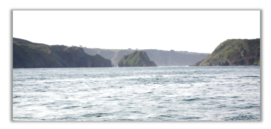
Figure 7 - Gouliot Passage between Sark (left) and Brecqhou (right) with Gouliot Rock (Moie du Gouliot) in the middle (photograph by author, April 6th 2011).