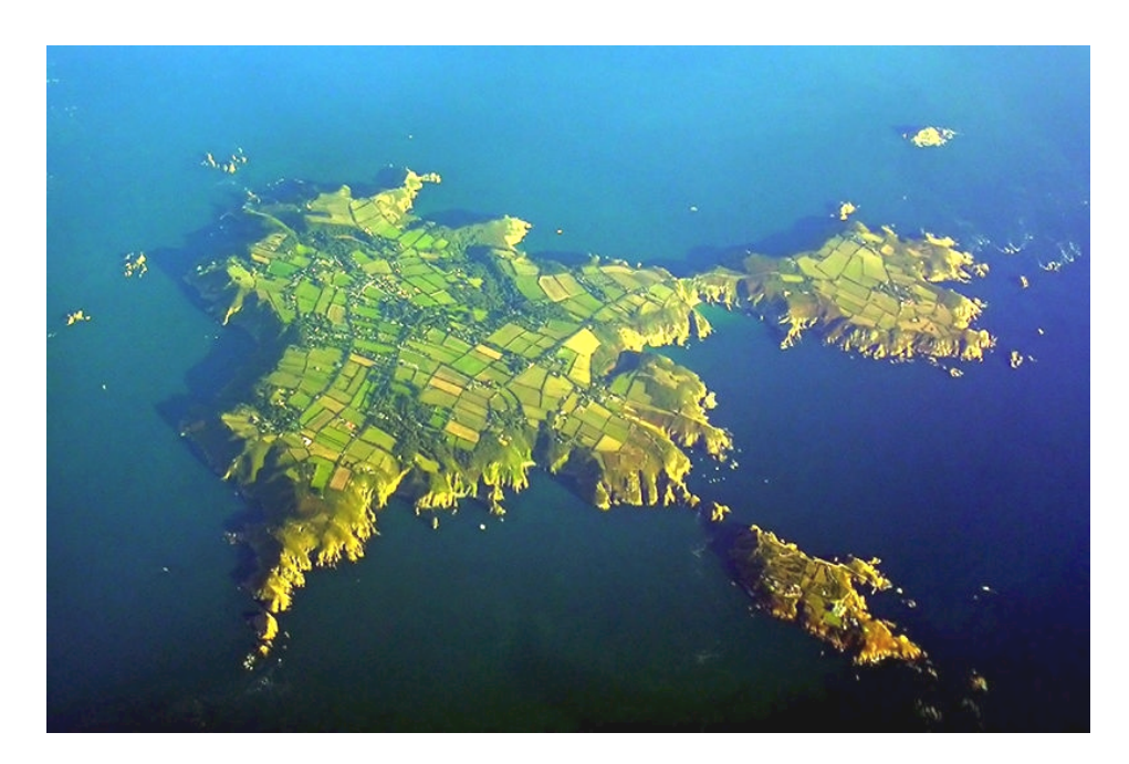
Figure 3 – Aerial photograph of Sark and surrounds (left and centre: Sark; lower right Brecqhou; upper/middle right: Little Sark; top right: L'Etac.

Historical method and critical discussion underpins this article, with field research being undertaken on Sark in 2011 and 2012 as part of a broader project in the Channel Islands. The discussion draws on discourse in the field of political geography, especially in connection with challenging the notion of island space as a static context, and focuses on discussing Sark in terms of "broader movements outside of geography that seek to replace ontologies of being, separation, and locatedness with those of becoming, connection, and betweenness" (Steinberg and Chapman, 2009: 1). While Brecqhou is a private island within the jurisdiction of Sark, and the current owners are tenants of "La Moinerie de Haut" – named after a medieval monastery that once existed on Sark), both islands extend their identities within the Bailiwick of Guernsey and further afield to Britain and Europe. In this archipelagic and (trans)political context, different conceptual dualisms of island identity exist, including being/becoming, separation/connection and locatedness/betweenness, each of which helps to show the modern-day place and space of Sark and Brecqhou in several interconnected and interdependent island and political units.