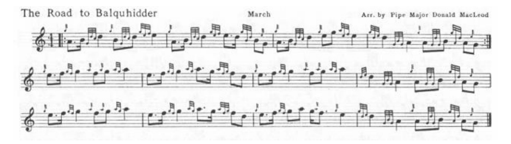
Musical Example 1 - 'The Road to Balquhidder' (Macleod, nd: 26)

Another feature of the piano songs that seems inconsistent with Gaelic folk song melodic design is the dearth of decorative techniques such as grace notes (quick notes or groups of notes immediately preceding the main melodic notes). In fact, of all the piano songs on the Lost Songs CD, only 'Hirta' (one out of eight piano tracks) uses this technique, and only sparingly (6 ornaments in a-2 minute track) By contrast, for example, traditional instrumental Scottish pipe music typically employs grace notes on at least half of the main notes of any melody as illustrated in the following (Musical Example 1) (MacLeod [nd]: 26), where we see the grace notes represented as much smaller in size than the main notes.