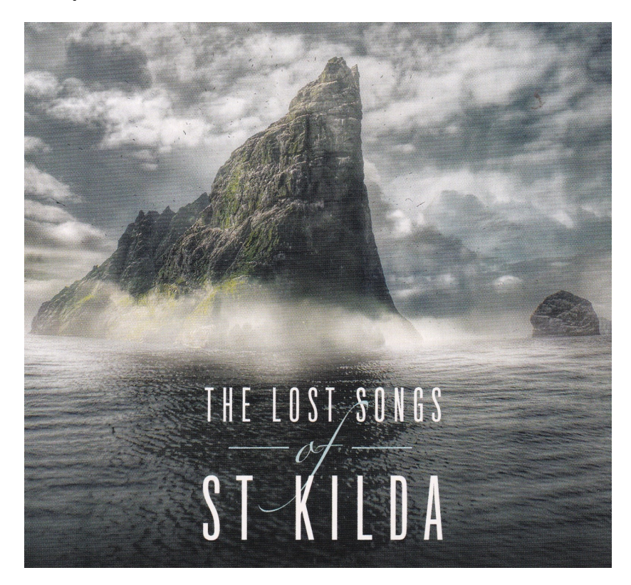
Figure 3: Front cover Lost Songs CD<sup>7</sup>

So far nobody recognises the songs. They are unknown, so they could be from St Kilda. Even if they're not it doesn't matter. It's just a beguiling story.<sup>6</sup>