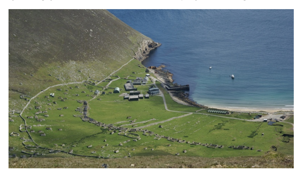
Figure 2: View over Village Bay and the military base

contracts. Today, the military base remains in operation, run by the private defence company Qinetiq, and, as St Kilda does not have an airport, military transportation is carried out by helicopter. Tourists can visit Hirta on one of the several small high-speed vessels that run from April to the end of September, leaving from the Isles of Harris, Uist and Skye. These boats generally seat twelve people, each paying around $300 for the day's experience, so tourist numbers to St Kilda remain low and sailings are often cancelled even at the height of summer due to weather and sea conditions. Therefore, St Kilda remains beyond the physical (and financial) reach of the vast majority of the British public.