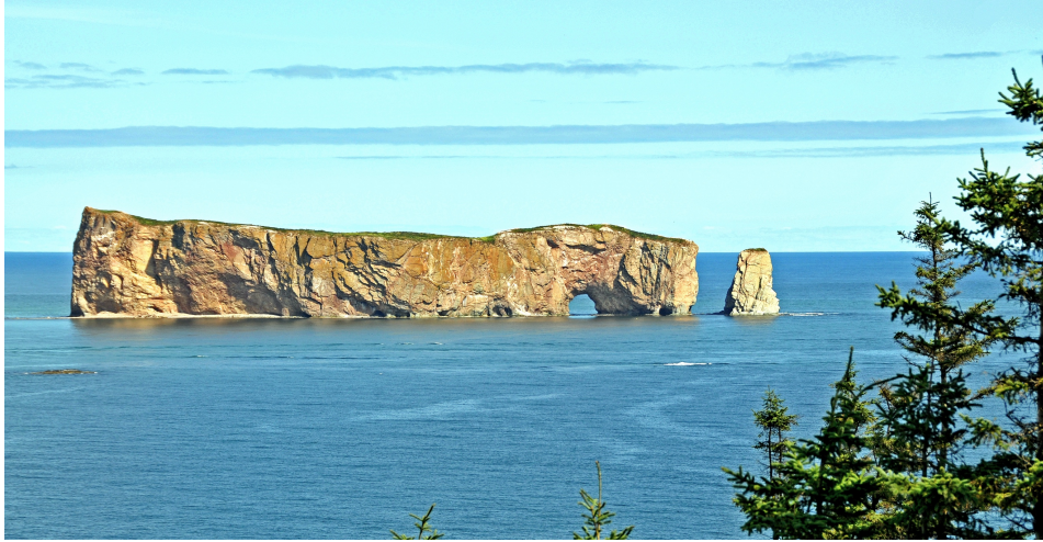
Figure 6 - Percé Rock/Rocher Percé (photo by Dennis Jarvis, courtesy of Wikimedia Commons:( https://commons.wikimedia.org/wiki/File:Percé_Rock.jpg ).

But it was the Melusinian fusion of opposites that really captured Breton's mind — in particular, the organic and the inorganic, as represented by the giant rock and its attendant bird life. On this he wrote eloquently: