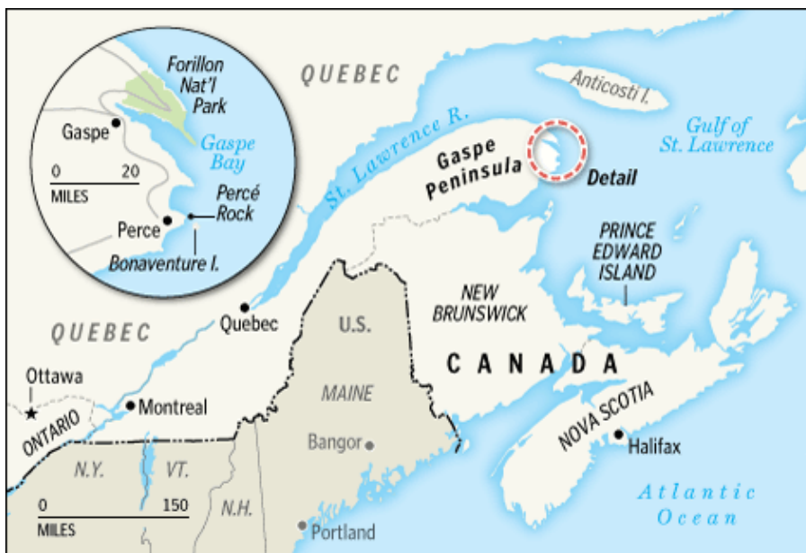
Figure 1 Map of Percé Rock and the Gaspé Peninsula.