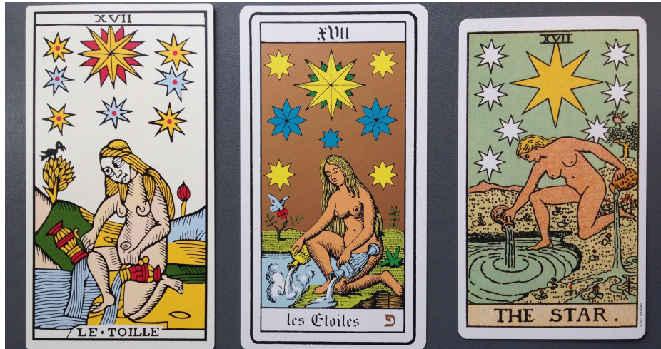
Figure 4 - Card # 17 – The Star – from various tarot decks. From left to right these are from: a Marseilles-style deck (Jean Dodal), an early 18th Century variant of the Oswald Wirth deck (note the butterfly and rose in the background); and the Rider-Waite deck.