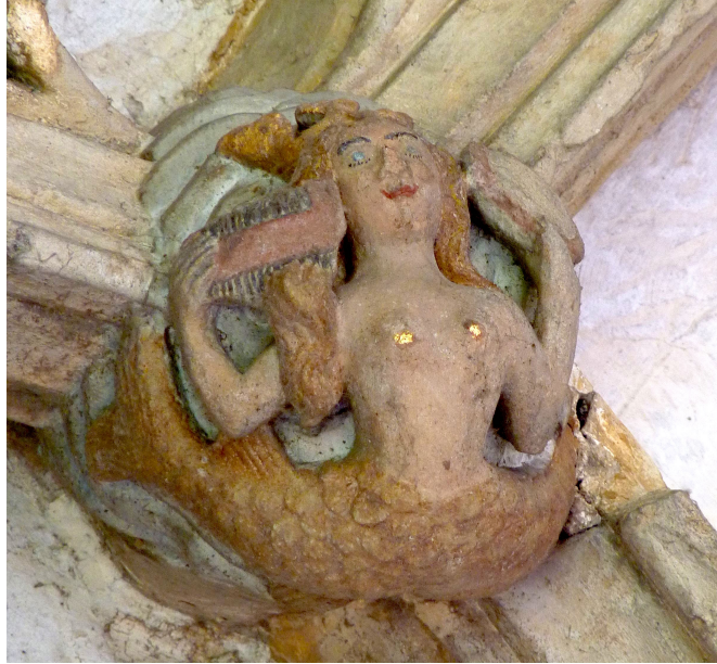
Figure 3 - Example of a late medieval twin-tailed mermaid holding a mirror and a comb at Canterbury Cathedral, Kent, England.