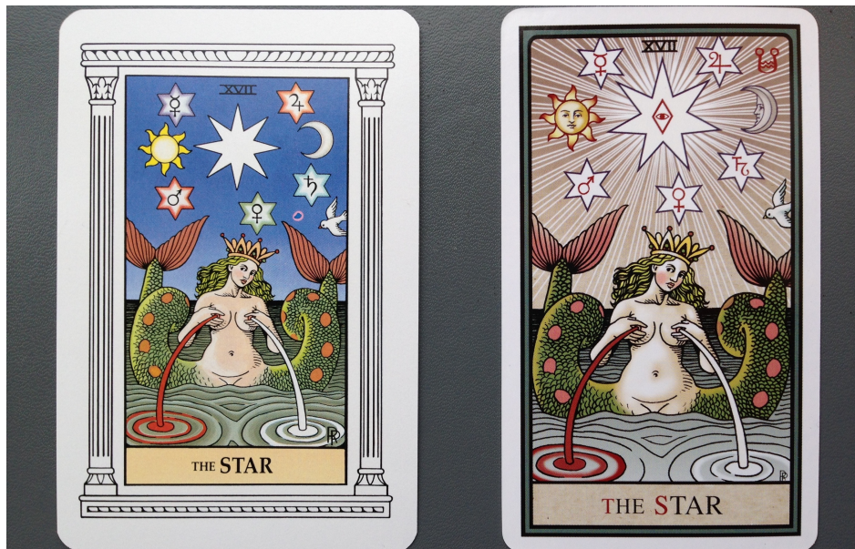
Figure 5 - The star card in Robert Place's Alchemical Tarot (1995). Left, the first edition from 1995; right the fourth edition from 2015, Mélusine as alchemical mermaid.

Again, Venus is closely associated and because of this connection, so are mermaids. Contemporary decks, such as those by Robert Place (1995), make the link explicit. In his Alchemical Tarot the mysterious water-pourer of the star card is replaced with a twin-tailed mermaid (Figure 5). However, there is a shared symbolism that can be traced back centuries