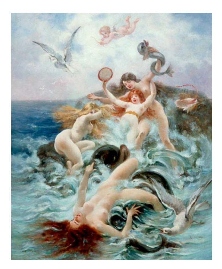
Figure 13 - Lalyre's 'Nereids' (date unknown).