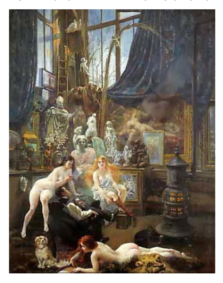
Figure 15 - Lalyre's 'Auto-portrait dans l'atelier' (date unknown).

The final painting considered in this article is Lalyre's self-portrait in his Carteret studio (Figure 15). In this work, he is depicted as turned away from the viewer, lost in contemplation of his models and paintings. He is encircled by three female figures, including one in the foreground seductively sprawled across an animal-skin rug. His female nudes are once again bathed in light to highlight their translucent flesh. Lalyre used Carteret as a place to turn away from many of the formal and philosophical concerns of the Modernist period. It was a retreat from the pressures of urban life but also from changing conceptions of gender. Lalyre's aesthetic style combined the academic religious and mythical elements of l'art pompier, Romanticist notions of personal expression, Impressionist elements and a Symbolist thematic focus on sirènes, touching on the surreal and the pornographic. In geographical and cultural terms, Carteret was slightly further afield than the well-worn paths of Le Havre and Dieppe. In this more sparsely inhabited (and thereby less scrutinised) space Lalyre's work was free to dwell in erotic decadence, out of the purview of tastemakers, in a sphere of arrested fantasy. The result is Lalyre's idiosyncratic vision of an eroticised liminal space where human meets nature and shore meets land. Lalyre makes of this space a desirous entanglement, equal parts Edenic realm and pornographic precipice.