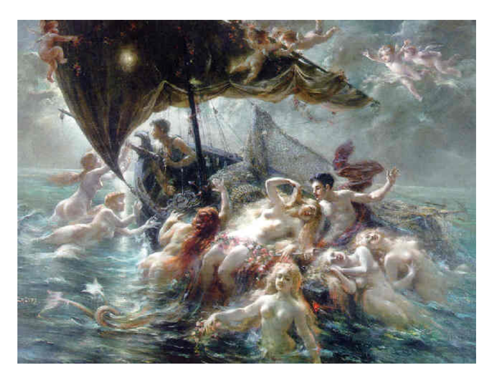
Figure 12 - Lalyre's 'Chansons des mer' (1912).

'Nereids' (date unknown) (Figure 13) provides a more elaborated representation of the marine forms suggested below the surface of 'Chansons des mer' and offers one of Lalyre's most vivid depictions of the sea creatures that occur as details in other works. While ambiguous as to whether there is a single entity or group of creatures in the waters, the sea gives forth a nest of tentacles that interweave in and around the intimate crevices of the nereids' bodies. While apparently enraptured, the nereids appear to have been abruptly thrown from their rock and into the swell. One redhaired nereid arches back into the waves, with an expression of serene pleasure, as tentacles and cresting waves surge between her legs. Another redhaired nereid is cast back against the body of the figure behind her in the thrust of the ocean spray. The background figure brandishes a small eel creature that appears as a phallic plaything. The figures laugh, intertwined with the creature(s), as a cupid points his bow and arrow, symbolically bestowing Eros to the totality of the scene.