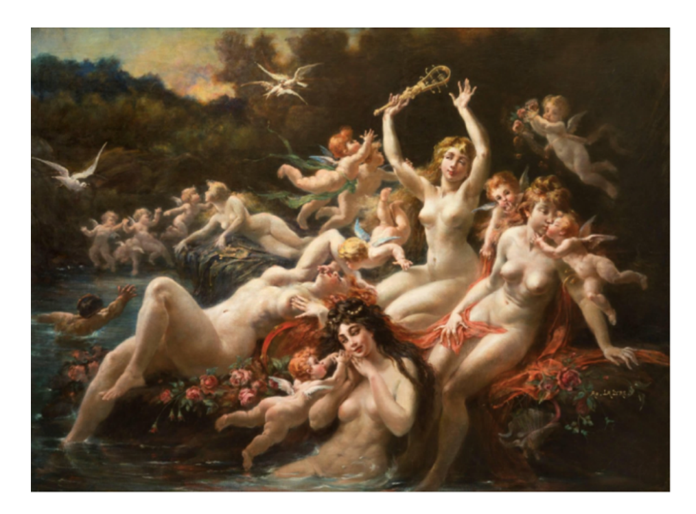
Figure 11 – Lalyre's 'Sirènes Lutinées par les Amours' (1910)