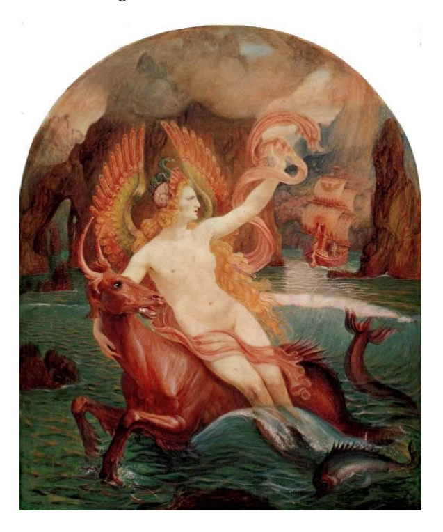
Figure 8 - The Symbolist femme fatale in Armand Point's 'Les Sirènes (1897).