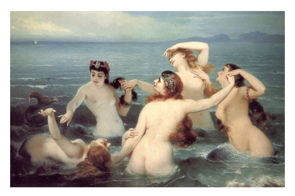
Figure 6 - The seascape in Charles Edouard Boutibonne's "Sirènes jouant dans la mer' (1883).

To some degree, Lalyre's sirènes resemble those represented in Charles Edouard Boutibonne's 'Sirènes jouant dans la mer' ('Sirens Frolicking in the Sea') (1883) (Figure 6). Like Lalyre, Boutibonne was a French painter of the academic classicist school. In his 1883 painting he presents a circle of sirens sea-bathing, with emphasis on their torsos and buttocks, as well as the floating hair of one of the figures. However, Boutibonne's sirènes are ambiguous in form. While the two central figures appear fully human, there is an ambiguity concerning the portion of the figure at right of image that is submerged, and the two figures at the left of the image are explicitly tailed. There is also an implied possibility of interaction with human mariners through the (very subtle) appearance of a ship at the left of the distant horizon. Boutibonne's seas are perceptibly calm and still, softly lapping at the sirens. His females emerge neatly from the water and bask unperturbed as two appear to eye the far away vessel.