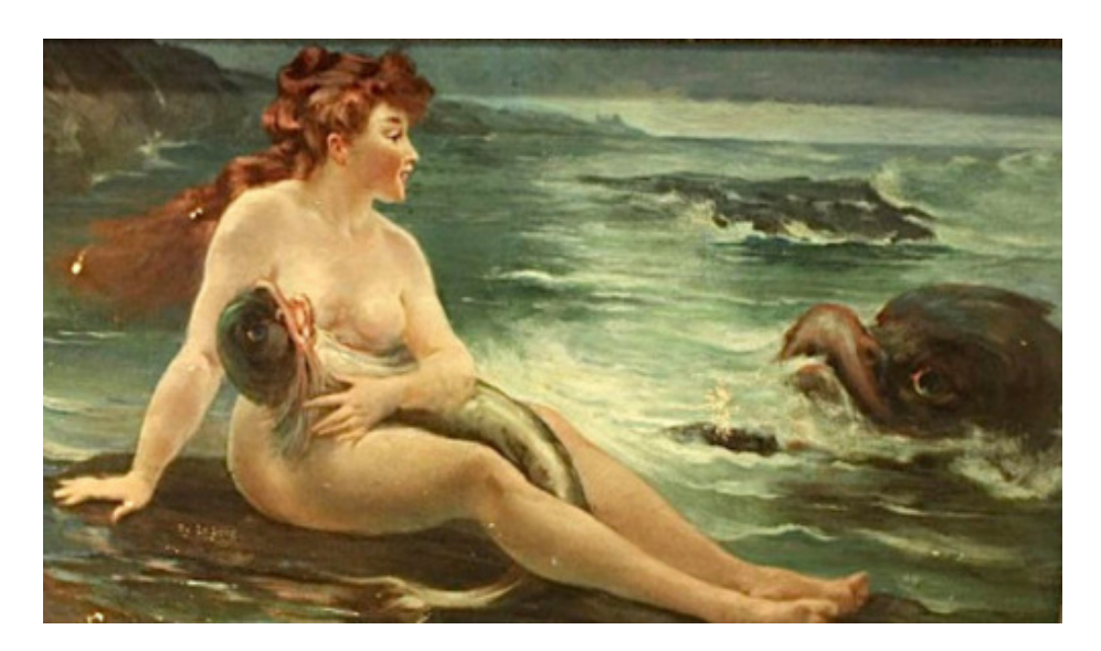
Figure 14 - Lalyre's 'Nu aux dauphins' (circa 1910)

Ultimately, the sea is not a zone of alien emptiness in Lalyre's work. Instead, its surface often shows a writhing mass of aquatic life that sometimes seems akin to the tentacles of a single (kraken-like) entity or, more often, that of a batch of large, eel-like creatures wriggling amongst each other. These creatures – whether simply unspecified details within broader canvases or, peculiarly identified in titles as dauphins (dolphins) — are in fact grotesque fantasy figures with cod-like heads and gaping maws and elongated tails. Their wriggling phallic forms bump against, curl around and interpenetrate groups of sirènes . The sirènes ' responses to these advances are variously comfortable or rapturous. The scenes do not suggest unwelcome bestial predation but rather the opposite. In these scenarios the sirènes are not human creatures inhabiting the integrated terrestrial and aquatic space created by human livelihood activities described by Hayward (2014) and Suwa (2017) as an aquapelagic zone, but, rather, they appear as liminal "boundary riders" of the terrestrial zone, adhering to rocks and shallows but intrinsically integrated with the aquatic space and its agents.