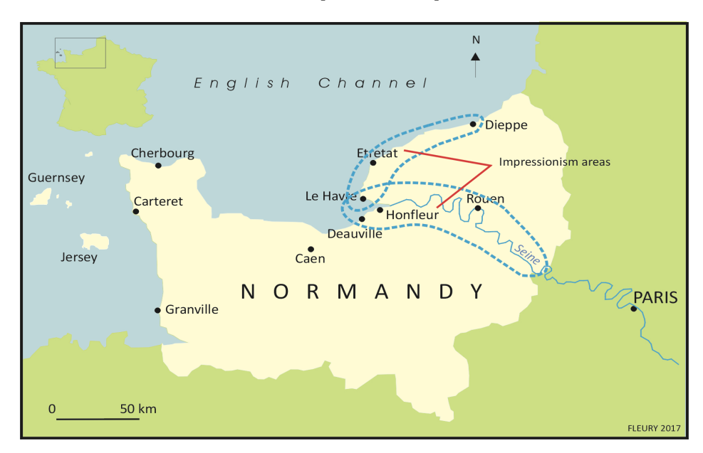
Figure 1 - Location of Carteret and the main areas in Normandy where Impressionist painting flourished (Fleury, 2017).

Between 1872 and his death in 1933, Lalyre spent a great deal of his time in Carteret, a small fishing village located in Western Normandy (Figure 1). This period is nearly co-extensive with that of the Third Republic (1871-1940), which operated between the end of the Franco-Prussian War and the beginning of the Vichy government. These years saw major political changes occur as the government of the Republic, which was initially a temporary one, became permanent and succeeded the monarchy. This was a time of tremendous tension in French society, including much debate over the place of religion. Lalyre himself reflected the contradictions of his time: accused of pornography in Paris for some of his paintings, he also created stained-glass windows for the Saint-Germain le Scot church in Carteret. Major socio-economic transformations also occurred, many of which impacted upon previously marginal, outlying areas of the country. The railway network rapidly expanded during the second part of the century, reaching many small coastal villages, particularly along France's north eastern coast. This transport infrastructure and the rise of an urban bourgeoisie with leisure time also fostered tourism development and the proliferation of seaside resorts.