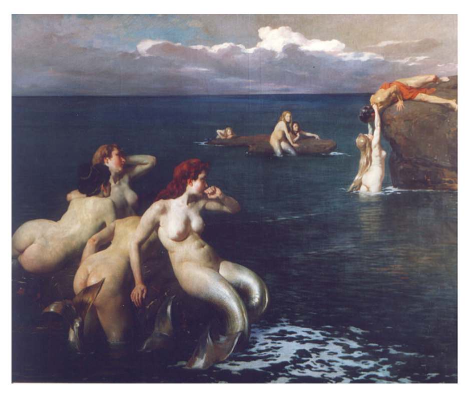
Figure 9 - The Symbolist femme fatale in Cesare Viazzi's 'Sirene' (1901).

Cesare Viazzi's painting 'Sirene' (1901) (Figure 9), meanwhile, presents his figures as more viscerally threatening. His sirens possess sharp, weapon-like, gun metal grey fish-scaled legs ending in fins and lurk at the surface of the still, dark water with poised lethalness. In the background right of the image, Viazzi returns to the motif of the seductive female pulling a male into the ocean depths. Landscape elements are minimal, the sirènes partially submerged. Both Point and Viazzi's representations draw strongly on (sometimes multiplicitous) mythological references symbolically and narratively conveying figures of fascination and deadly potency.