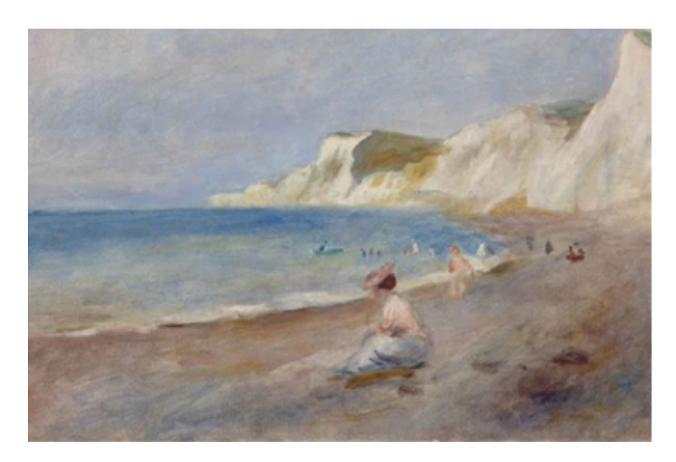
Figure 4 - Auguste Renoir's 'La plage de Varengeville' (c1880).