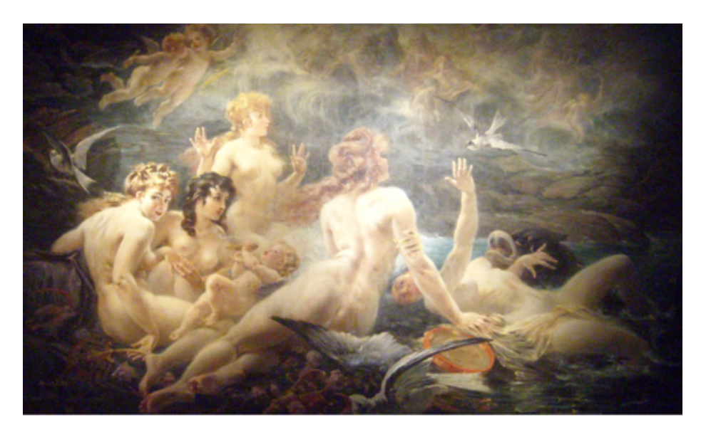
Figure 10 – Lalyre's 'Les Sirènes visitées par les muses' (date unknown)

in the flesh of the surrounding female figures. A pair of cupids is also depicted in the skies in embrace, enamoured of one another, and curiously serene in the face of the oncoming muses. Once again, mythological connotations serve secondarily to the overridingly sensual and fecund.