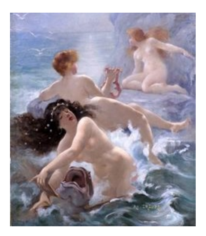
Figure 7 - Lalyre's 'Sirènes dans le surf' ('Sirens in the Surf') (date unknown)

Lalyre's paintings often depict his sirènes in teeming multiplicities, emerging from the waters on their bellies or backs like large catches of fish. In these, his female figures are not individualised, but rather essentialised, nearly devoid of all artifice and modernity.