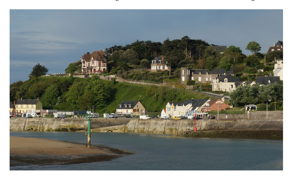
Figure 16 - A view of Carteret Harbour. Le Château des Sirènes is the third house from the left on the hill (photo: May 2017, Benoit Raoulx)

What then, is the legacy for Carteret of Lalyre's presence and vision? In fact, there are few traces of his work in the contemporary context of the town. The stained-glass windows of the Church of Saint-Germain le Scot were destroyed in an Allied air raid in the summer of 1944. Château des Sirènes, though still visible (see Figure 16), is no longer owned by the artist's descendents, nor is it heritage listed or featured as a landmark in tourist guides.