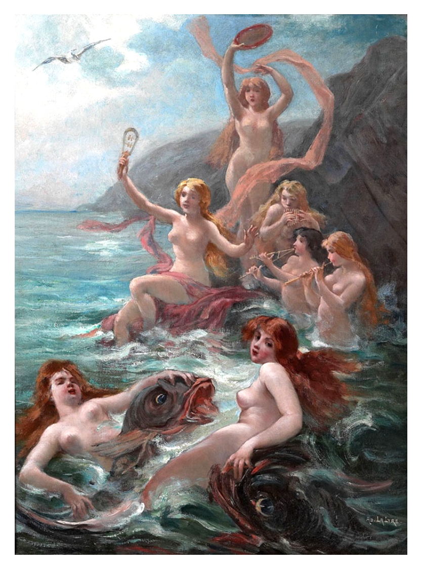
Figure 5 - Lalyre's 'Le concert des sirènes' (1922)

groups. The five at the rear are posed in concert, playing archaic classic instruments, while the two in the foreground tumble in the surf, as waves crest and foam in and around their soft, ample flesh. Two prominent large-mouthed sea creatures cavort proximately to their bodies in the foreground, suggesting their intimate caress of the sirens' breasts, pubic areas and posteriors. In this scenario female carnality is implicated in bestial desire. This type of configuration is typical of many of Lalyre's sirène paintings. Noticeably absent are the human male bodies of sailors, either being carried to safety or being seduced to their demise. Rather, as will be discussed in detail below, Lalyre's images appear to contemplate female amusement (and pleasure) as (at least partially) a circuit of desire between female bodies and the sea and the creatures that inhabit it — a scene frequently marked by orgiastic excess, engulfment and female gratification.