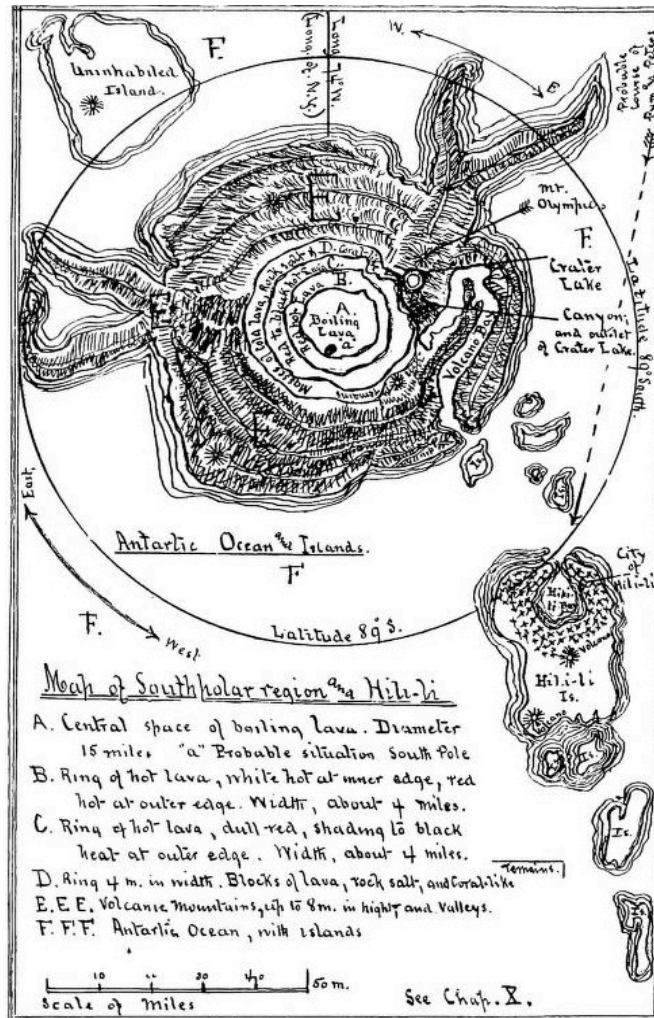
Figure 1: The Antarctic archipelago in Charles Romyn Dake's A Strange Discovery (1899)

Other creative re-mappings of the polar regions are more overtly political. Thus, a map entitled 'Denmark' (2004) by Inuk Silis Hoegh and Asmund Havsteen-Mikkelsen shows Denmark as a Greenlandic colony (Figure 2). The map depicts Qallunaat Nunaat ('the land of the white people/Danes') as an Arctic archipelago with mountains and ice sheets that resemble those of Greenland. Its archipelagic appearance is underscored by the fact that the Jutland peninsula is cut off from continental Europe, and the Swedish mainland does not appear (instead, we only see the blue sea). The cities, seas, ice sheets, glaciers, and coastal regions carry the names of well-known Greenlandic personalities from different time periods, such as politicians and artists, while others are given a range of other Greenlandic names, sometimes with the Danish names written added in small letters and in brackets, inverting Danish colonial naming and mapping practices. Copenhagen, for instance, is renamed as "Nunap Utsussua" ('The Land's Great Vagina'), mockingly evoking figurations of colonial lands as female bodies. Two small islands on the west coast of