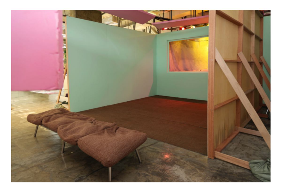
Figure 2 – Mountain Surrounded by Sea exhibition image (author's photo, 2020).