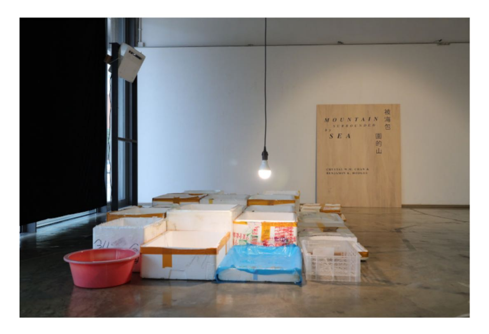
Figure 3 – Mountain Surrounded by Sea exhibition image.