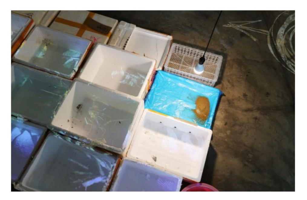
Figure 5 – Mountain Surrounded by Sea exhibition image.

Of course, Macao is not a mirage, but it is a city built of both real land and artificial visions. What is interesting about this new five island project is that it preserves Macao's 'islandness' by maintaining a wet border. This speaks to the value of the sea and waterfront from residential developers' and homeowners' perspectives. The value of the sea view is being maintained and amplified. This is a change in approach from earlier reclamation projects that added land without necessarily adding new waterfront spaces. The Nam Wan and Sai Wan lakes were created through land reclamation projects that began in 1991. They did preserve the historic waterfront of the Avenida da Praia Grande but the stretch of new reclamation that sealed it off has been in a perpetual state of transition. Its multiple new commercial spaces have alternately laid empty, served as a safe fireworks zone during Chinese New Year celebrations and as a depot for Macao's large fleet of buses. These functions differ greatly from the park, running trails and bike paths that are proposed for the new waterfront.