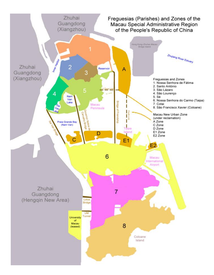
Figure 1 – Map of Macao with Macau Urban New Zone (Alan Mak, 2011, Wikimedia Commons).1

Of course, this project didn't emerge sui qeneris from the sea. It is one of five new islands proposed as part of the Macau New Urban Zone project. Since January 2020, Zone C of the project has been under construction between Taipa island and the Macao peninsula. This involves a slow process of barges of sand being brought into the area to pump their cargo into the shallow bay. This same central location was previously proposed in 1918 by a group of Canadian engineers as a reclamation site to be called Ilha Rada ('Port Island') (Haberzettl and Ptak, 1991: 303). That project was never realised, but numerous other reclamation projects have redefined the shape of Macao. What is striking about this current project for five new artificial islands is that they are independent islands being added to Macao's waters instead of extensions of existing land masses. Also, Zone C will be situated directly across from Ocean Gardens (which promotes itself as Macao's "premier luxurious development") an extensive complex of 34 residential buildings and 21 villas replete with all the amenities from shopping to schools to parks, and a "tranquil waterfront promenade." This kind of pedestrian-friendly promenade can be found along Macao's historic Praia Grande waterfront but is otherwise largely absent in the previous reclamation zones of Macao and