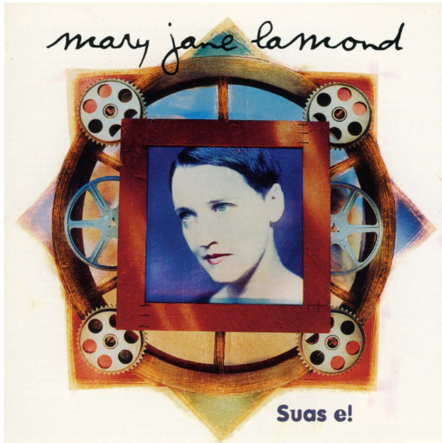
Figure 2 - Suas e! CD front cover