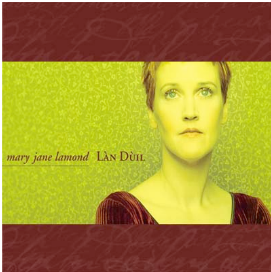
Figure 3 - Làn Dùil CD front cover

simultaneously directed at a local audience who would instantly recognise the images, despite the mainstream pop orientation of the album.