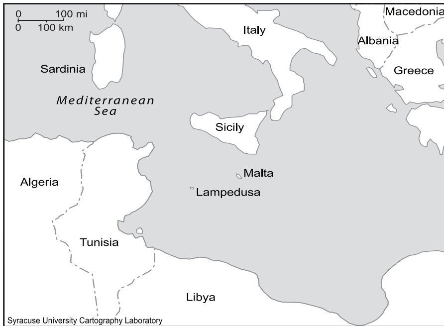
Figure 2 - Lampedusa and location in Mediterranean