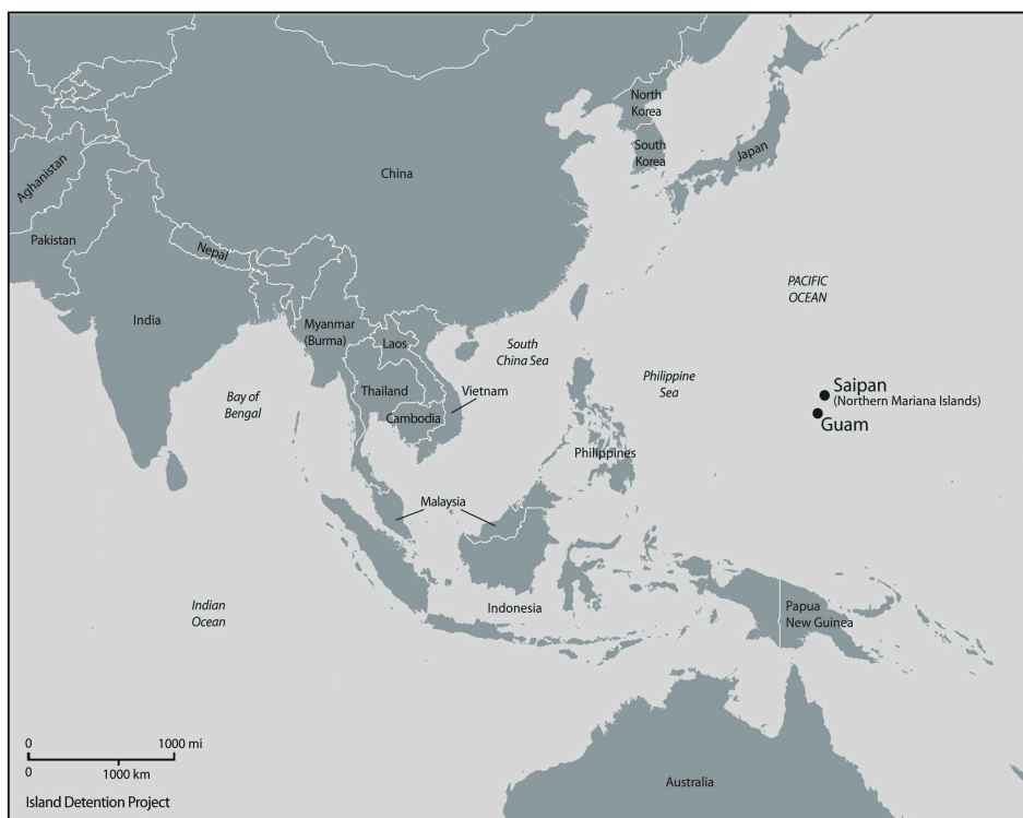
Figure 1 - Location of Guam & Saipan in Asia-Pacific region (map by Robert S. Fiedler)