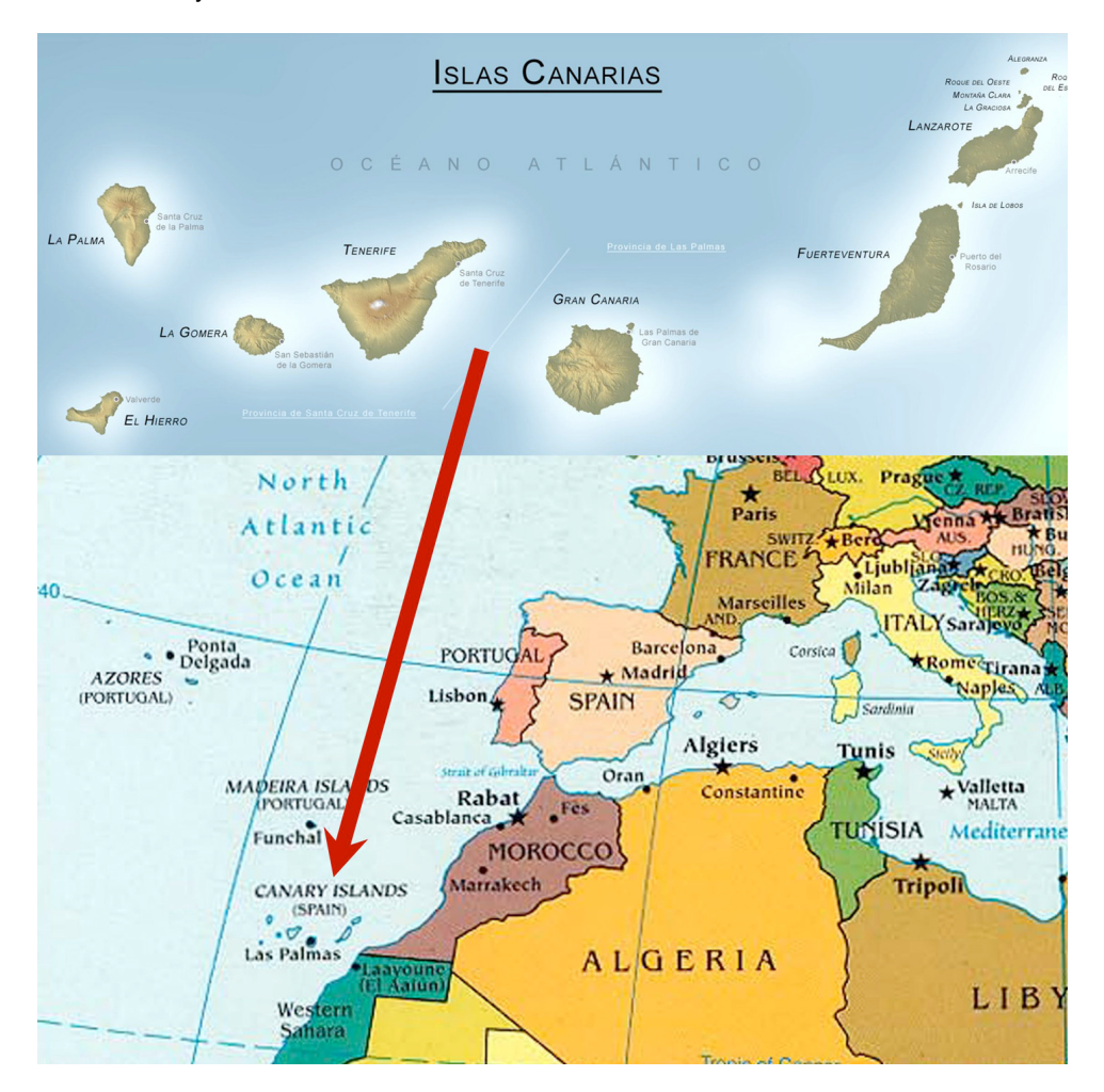
Figure 1 – Location of the Canary Islands

these Canarian islands are inhabited; this fact and the islands' small sizes are presumably reasons for their exclusion from popular and institutional discourses (weather forecasts, maps, trade books, transportation routes, and my study up to that point). They are unique in their peripheral status — among the already peripheralised Canary Islands — as spaces that are often exnominally displaced in linguistic and cartographic formations of 'The Canary Islands', both locally and globally. Mentioning them requires additional qualifiers, exceptions that allow them into conversation, but simultaneously situate them outside normative discourses on the Islands.