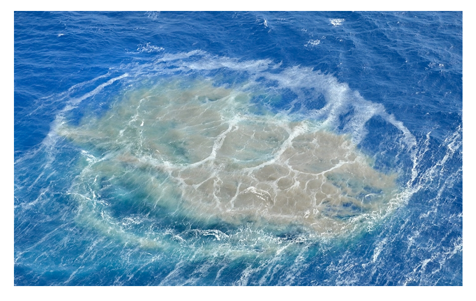
El Heirro underwater volcano, 2011

Recently, an update to the Google Earth website corrected earlier glitches that incorrectly mapped many areas of the world. Among the un/written mappings was an area of the Atlantic Ocean near the Canary Islands and Madeira that eager, imaginative cartographers had been speculating was perhaps the lost city of Atlantis - yet another origin myth for the Canary Islands.<sup>21</sup> Evidently, there are still those who would map these unforeseen islands like St. Brendan's, as there have been those who sought to recreate his journeys inscribed in the Irish immrama.<sup>22</sup> While this upgrade to Google Earth re/erases Atlantis/San Borondón from the global map, it still falls short of its efforts to represent accurately: the Roque Islands - part of the Chinijo archipelago of which La Graciosa is one island – are glossed over completely. In Google's 'Earth', the seven-island archipelago of the Canaries is there, but the thirteen-island archipelago is not. Meanwhile, an underwater volcano located off the coast of La Restinga. El Hierro. erupted between July 2011 and March 2012 and talk of an eighth (twelfth? fourteenth?) Canary Island has surfaced." Emergent geography ruptures and evades the surveying cartographic imagination that generates continuous failure in its attempts to represent las Islas Canarias.