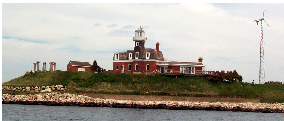
Figure: North Dumpling Island (with miniature model Stonehenge to the left)

Although owning an island in the Sound and considering it to be a land apart is not an unheard of notion, few people have gone to such theatrical lengths to establish a semblance of sovereignty. (Ravo, 1988: online)